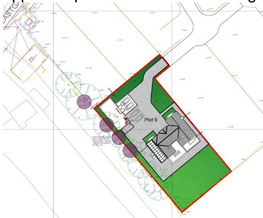
(Approved plan from 140545)

The existing dwelling to the north west is on the opposite side of the road and the front elevation of approved Plot 9 (140545) is approximately 35 metres from the rear elevation of the proposed bungalow in this application. Plot 9 (see below) as approved additionally has an outbuilding which on the plan below is positioned close to the shared boundary with plot 1. A condition (No.6) on the reserved matters approval (140545) requires detail of the final position of the outbuilding. A condition discharge application (142374) has been submitted but not determined as yet. It is not expected that the amenity of the future residents of plot 1 would be significantly affected by the final approved position of the outbuilding.