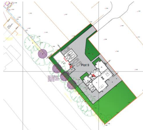
(Plan under consideration from 142374)

The proposed development would therefore not have a significant impact on the living conditions of 7 Eastgate or the potential future occupants of plot 9. The final approved outbuilding to plot 9 is not expected to have a harmful impact on the future occupants of plot 1.