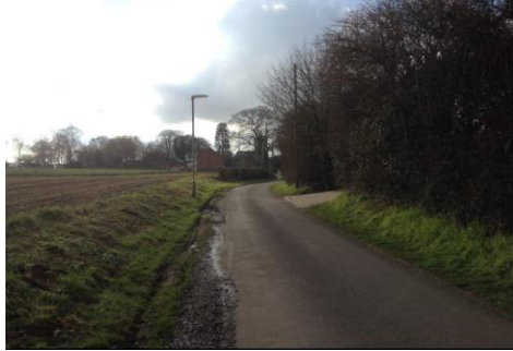
(View 1 Photo)